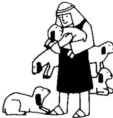
Church Clip Art Mega Pack, Gospel Light, Ventura, CA