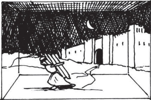
A VIEW INSIDE THE BOX.