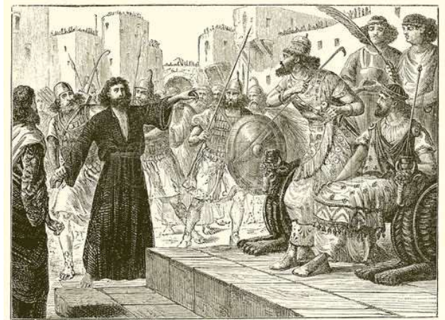
MICAIAH BEFORE AHAB, KING OF ISRAEL, AND JEHOSHAPHAT, KING OF JUDAH