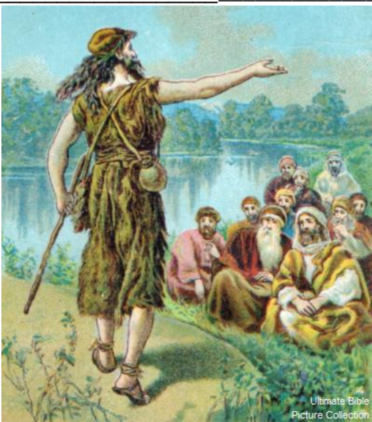
Ultimate Bible Picture Collection