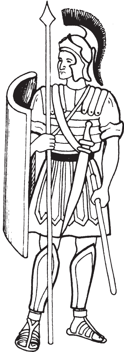
Colour in the picture of the Roman Centurion.