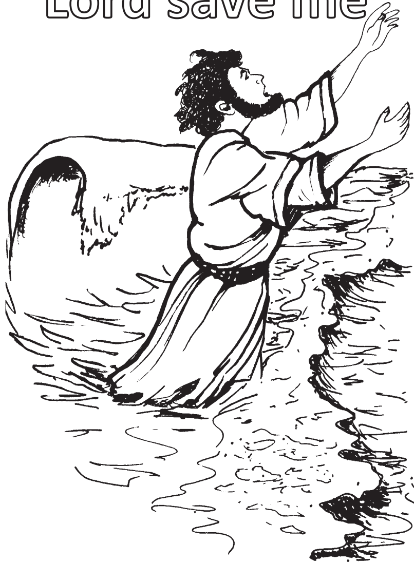
Colour Peter sinking into the sea.